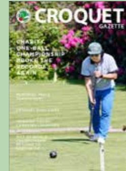
Front cover: Charity One-Ball Championship

The Croquet Association Issue 397 | June 2022