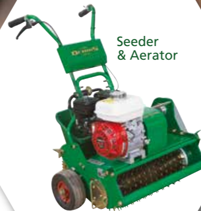
Seeder & Aerator