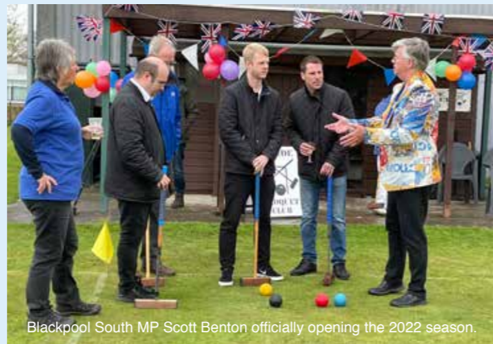
Blackpool South MP Scott Benton officially opening the 2022 season.