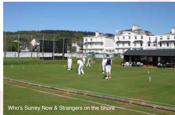
Who's Surrey Now & Strangers on the Shore