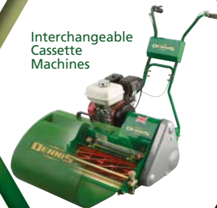
Interchangeable Cassette Machines