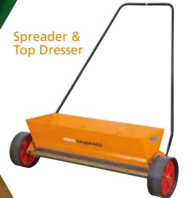
Spreader & Top Dresser