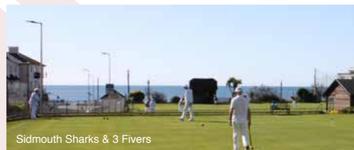
Sidmouth Sharks & 3 Fivers