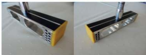
9 5/8" STANDARD

PFC MALLETS are absolutely unique and because THE MATH INVOLVED IN MANUFACTURE OF EACH Mallet, they cannot be copied.