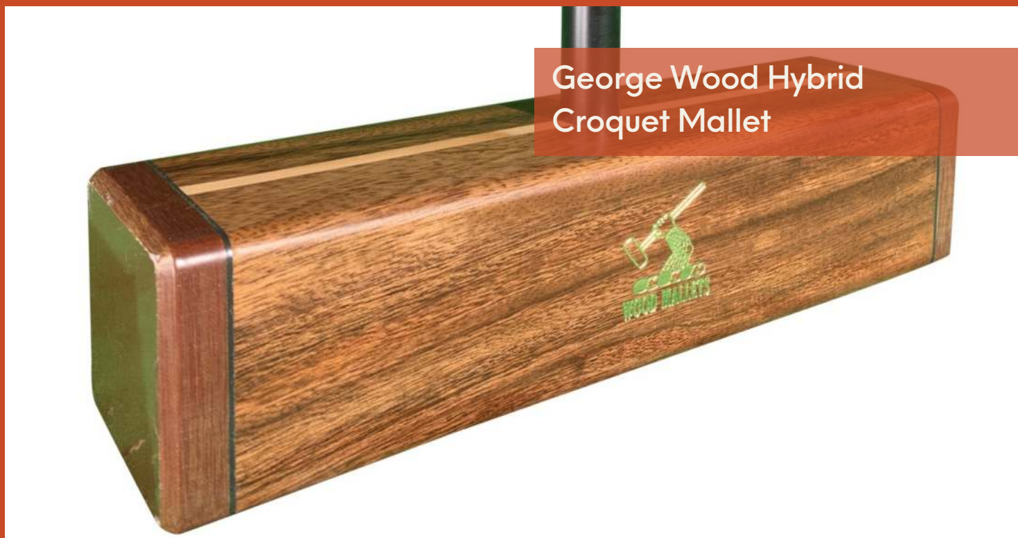
George Wood Hybrid Croquet Mallet