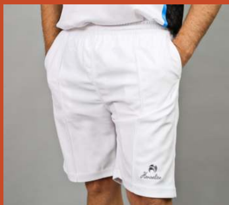
White Henselite Sports Shorts

Our Aim at the Croquet England Shop is to provide equipment to Croquet Players and Croquet Clubs. We have Croquet Sets for fun games in the Garden as well as Mallets, Books and Clothing for Club Players. We also supply balls and hoops which meet CqE tournament regulations for Croquet Clubs.