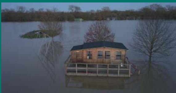
By Roger Booth

Eynsham Croquet Club had only just completed its scheduled end-of-season maintenance in September 2024 when disaster struck. In October