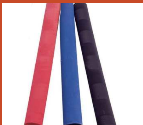
Hi-Tac Performance Overgrip