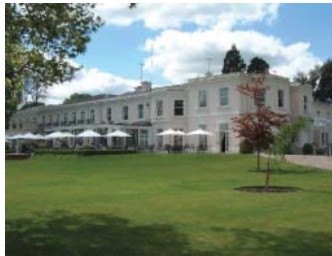
The Phyllis Court Club

The Club remained opened throughout the First World War,