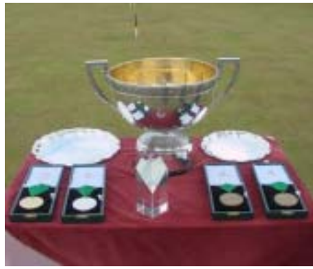
The Trophy display for the winner runner-up and losing semi finalists, as well as rewards for the manager and organisers.