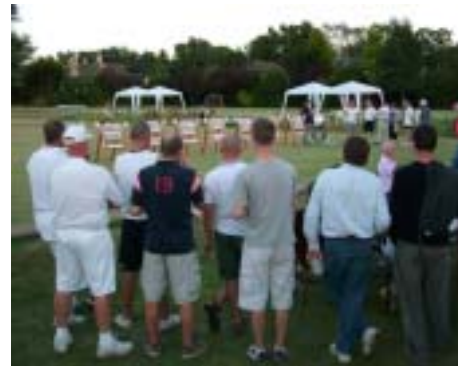
The players watching the draw for the knockout stage unfold before them on lawn 8