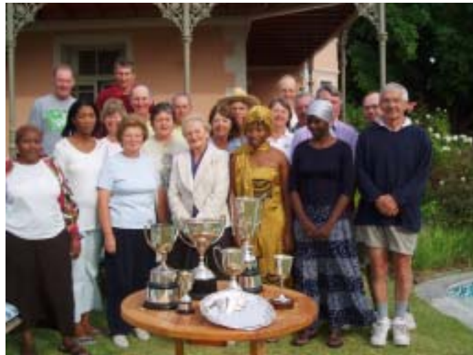
Players and visitors with the tournament prizes.