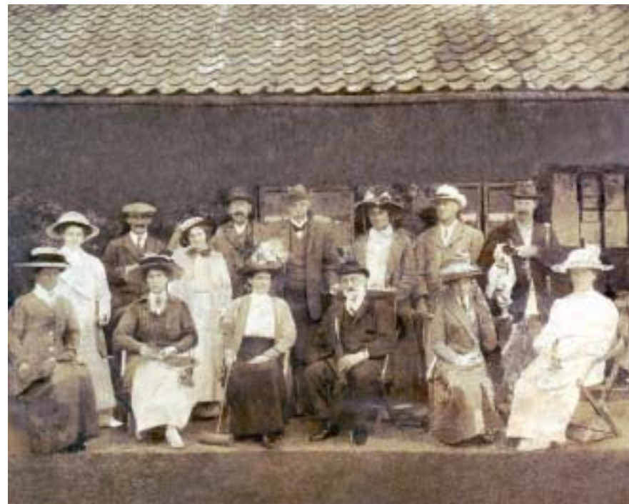
Pre World War I Members at Woking

Players who were fostered out to play at nearby residences were very well looked after and "several well-known hostesses in the locality entertained large house parties and were present in force at the tournaments, much to the delight of the representative