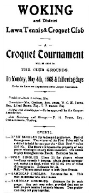
Gazette advertisement for the first Woking open tournament in 1908

The Club started its first annual open week long croquet tournament on Monday the 4 th of May 1908, there being no matches played in those days over the weekends and indeed no play of any description permitted on Sunday mornings. Woking is one of only four clubs in the country that has a virtually unbroken record apart from the periods of the two world wars, of holding annual weeklong open tournaments.