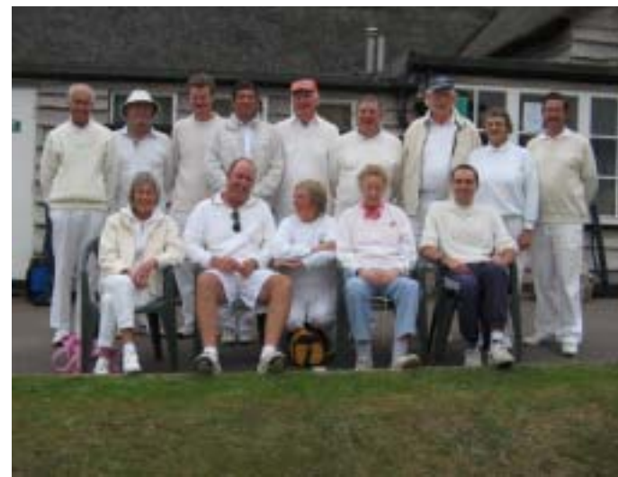
A happy little group of competitors at Sidmouth.

A cool North Easterly wind with bright warm sunshine gave