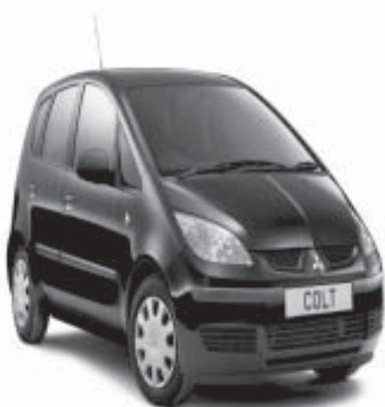
The Mitsubishi Colt range from £7,999 OTR

Sleek design and modern attitude. Underneath the clean-cut, contemporary exterior the stylish driving environment in which to enjoy the most spacious cabin in its class.