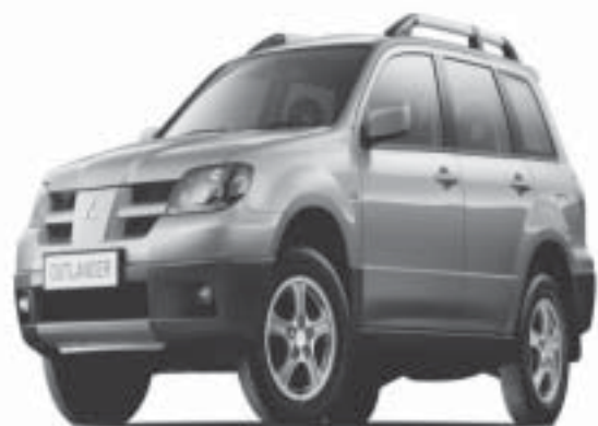
The Mitsubishi Outlander range from £16,999 OTR

Sleek design and modern attitude. Underneath the clean-cut, contemporary exterior the stylish driving environment in which to enjoy the most spacious cabin in its class.