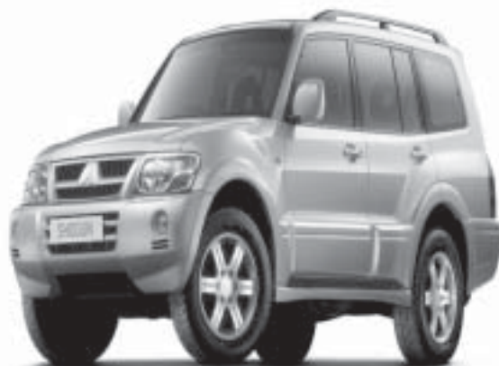
The Mitsubishi Shogun range from £22,999 OTR

It is as amazing to look at as it is to drive. Concealed beneath its sporty curves is a super seating system and our unique Hide and Seat system* that allows you to transform from a 7 seater into a 2 seater in seconds.