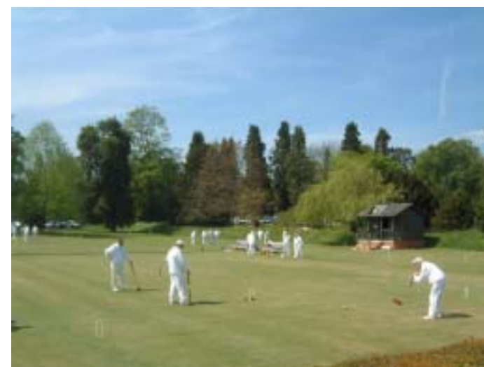
Play in progress at the Phyllis Court Club