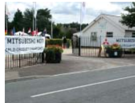
Cheltenham Club awaiting the first of many visitors

Eighty players from nineteen countries, dozens of officials and helpers, hundreds of spectators, four clubs, twenty one lawns, and nine days went into making the Mitsubishi Motors 2005 World Croquet Championship the largest and most successful croquet event of recent years.