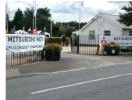
Cheltenham Club awaiting the first of many visitors

Eighty players from nineteen countries, dozens of officials and helpers, hundreds of spectators, four clubs, twenty one lawns, and nine days went into making the Mitsubishi Motors 2005 World Croquet Championship the largest and most successful croquet event of recent years.