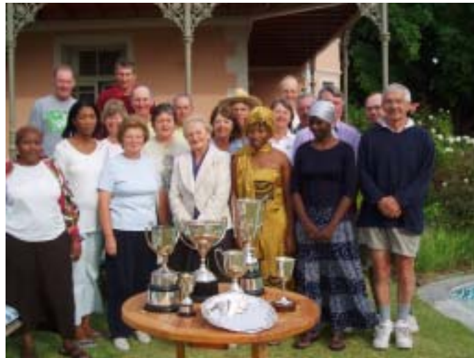
Players and visitors with the tournament prizes.