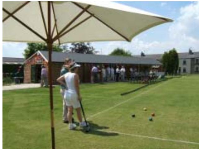
Pendle & Craven's new facilities were declared officially open on a glorious sunny day.