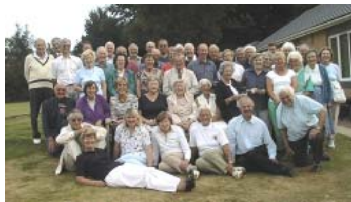
The photograph shows some of the 90 Club members who helped before and during the Championship.