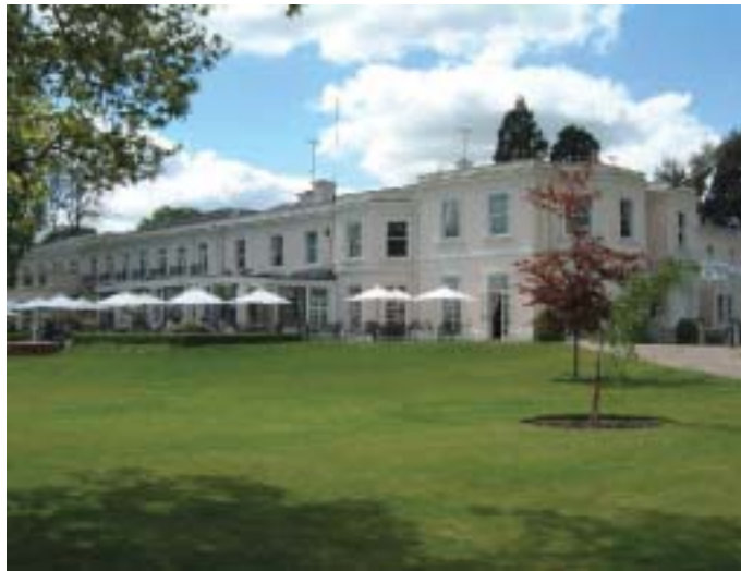
The Phyllis Court Club

The Club remained opened throughout the First World War,