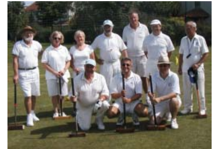
The competitors take a break from playing for a group photograph.