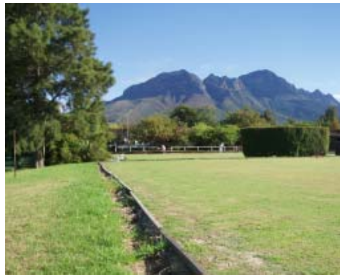
Swap the mountain for a tree and you could be in Cheltenham, weather permitting.