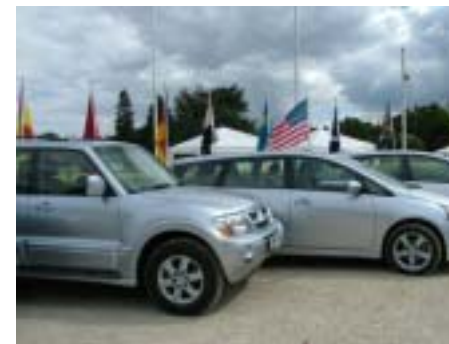
The Mitsubishi’s players transport awaits its first customers.

Like most other players, I arrived on Friday 5th August to see a Cheltenham Croquet Club transformed from the last time I was there. It was immediately clear that an enormous amount of work had already gone into preparation for this event - the