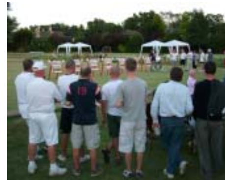
The players watching the draw for the knockout stage unfold before them on lawn 8