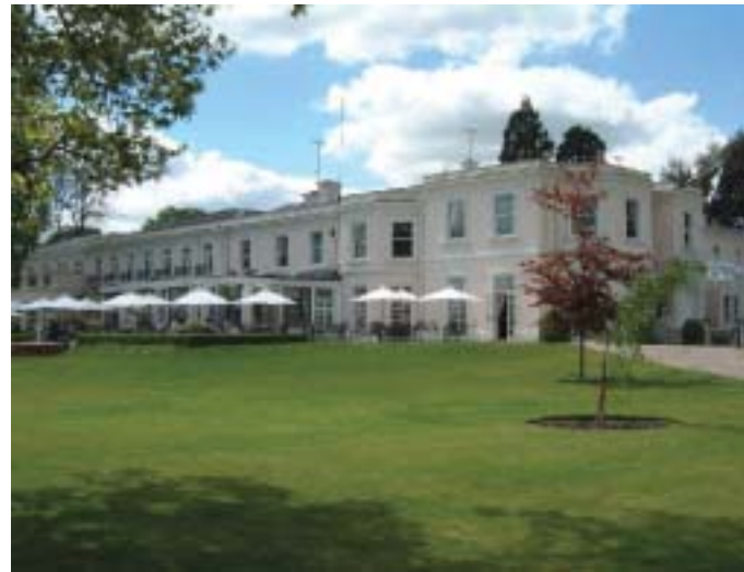
The Phyllis Court Club

The Club remained opened throughout the First World War,