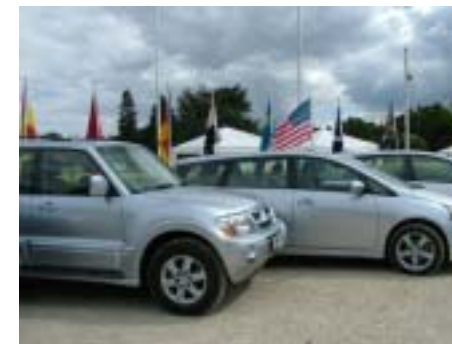
The Mitsubishi’s players transport awaits its first customers.

Like most other players, I arrived on Friday 5th August to see a Cheltenham Croquet Club transformed from the last time I was there. It was immediately clear that an enormous amount of work had already gone into preparation for this event - the