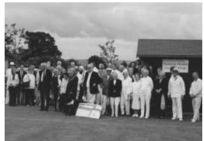
Saturday June 4th, opening ceremony group Photo.

By 1991 it became apparent that if the club was to survive and prosper we had to find a new home, particularly as the Borough Council, who owned the land, were contemplating housing development. We scoured Taunton, following up many leads and false trails but eventually struck a deal with Taunton School for a twenty year lease on flat land beside the entrance to their playing fields. We laid out two and a half lawns with drainage and bought a new hut, all financed by members and started playing there in 1993. Membership expanded with improved lawns and space but over time the lack of convenient toilet facilities, involving a long walk to the school, the proximity to a busy road and more recently, increasing vandalism caused problems. By 1999 it had also become apparent that Taunton School had potential development plans for the area which could be fatal. We started looking again and this time we struck lucky. I had a chance meeting with a farmer