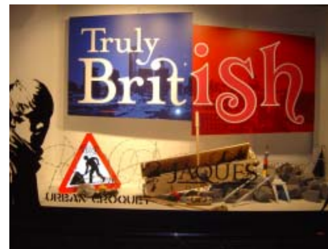
Can anyone guess the shop window this display appeared in?

The lottery application was submitted to Sport England in March 2002 with a request for a grant of 52% of the total project costs, approximately £30000. The total cost included lawn construction, design fees, legal fees, planning fees and extra croquet equipment for a third lawn and an increase in members. As prime mover on the lottery application and dealings with Sport England it was an experience. I was even invited to do a course in "Lottery Speak" but having spent many years trying to speak and write Plain English, I declined with "regret". Some aspects of the application were quite difficult to write, particularly on the need to satisfy requirements for the ethnic minority, the handicapped etc. Taunton has a very low ethnic population and at times it was difficult to make the case compelling, given the predominantly white, middle aged, reasonably sighted and self-propelling nature of most of our members and prospective members. However we