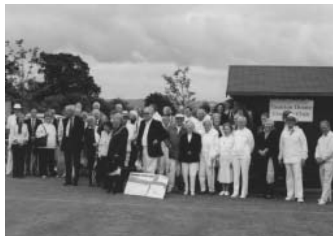
Saturday June 4th, opening ceremony group Photo.

By 1991 it became apparent that if the club was to survive and prosper we had to find a new home, particularly as the Borough Council, who owned the land, were contemplating housing development. We scoured Taunton, following up many leads and false trails but eventually struck a deal with Taunton School for a twenty year lease on flat land beside the entrance to their playing fields. We laid out two and a half lawns with drainage and bought a new hut, all financed by members and started playing there in 1993. Membership expanded with improved lawns and space but over time the lack of convenient toilet facilities, involving a long walk to the school, the proximity to a busy road and more recently, increasing vandalism caused problems. By 1999 it had also become apparent that Taunton School had potential development plans for the area which could be fatal. We started looking again and this time we struck lucky. I had a chance meeting with a farmer