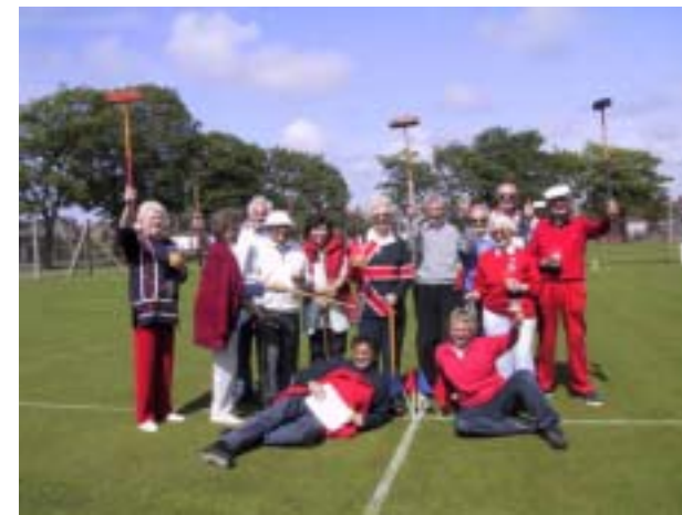
Fylde Club members celebrating Trafalgar day and new lawns

glass in the area. The Council then decided to lock the area and allowed the croquet membership to have keys and this provided us with some improvement although the local youth, having once had free access, obviously thought it was now within their rights to climb the fences and abuse the facilities as before.