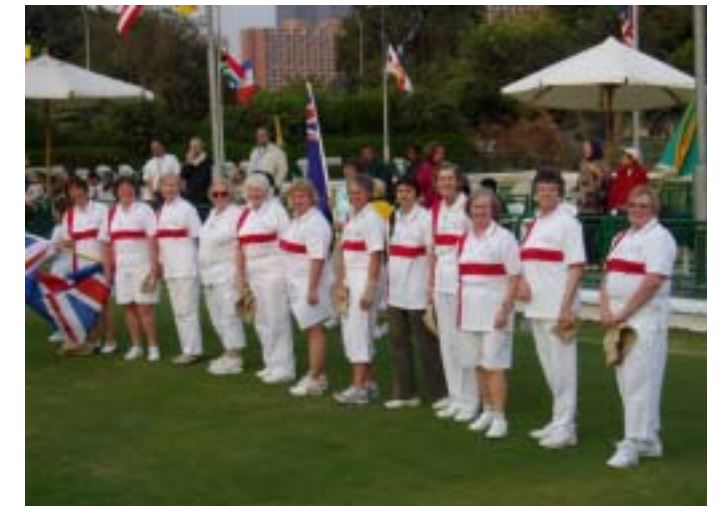
The English players at the opening ceremony

And so to the play. The field was divided into eight blocks