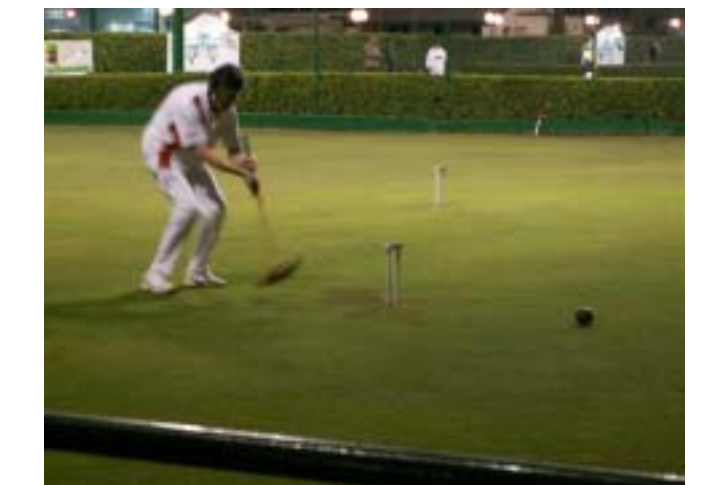
Norma Rayne running a hoop

The Gezira club, located on Cairo's Zamalek island, is more like Hurlingham than Sahara. With umpteen tennis courts, two golf courses, even a horse racing track, it's amazing that they have found room for croquet, and yet there are three lawns owned by the host club itself, and three lawns located separately which form the headquarters of the Egyptian Federation. All six lawns