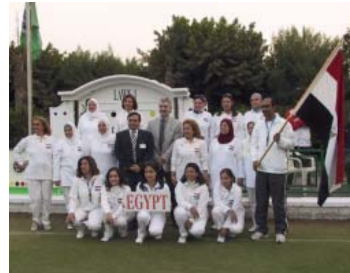
The Egyptian entrants

After the middle of October, the prospects for UK-based croquet players are fairly limited. The majority are resigned to a freezing winter, where the closest they come to genuine competitive play is to re-read old copies of the Gazette, perhaps re-living ancient victories, or to leaf once more through that yellowing copy of Tollemache, with the fond hope that this time it will make more sense than in the past. For a few, there is the opportunity to play on the small number of winter lawns, but unsurprisingly these are often slow, the grass is uncut, and the weather can be guaranteed to be either raining, chilly, or most likely both.