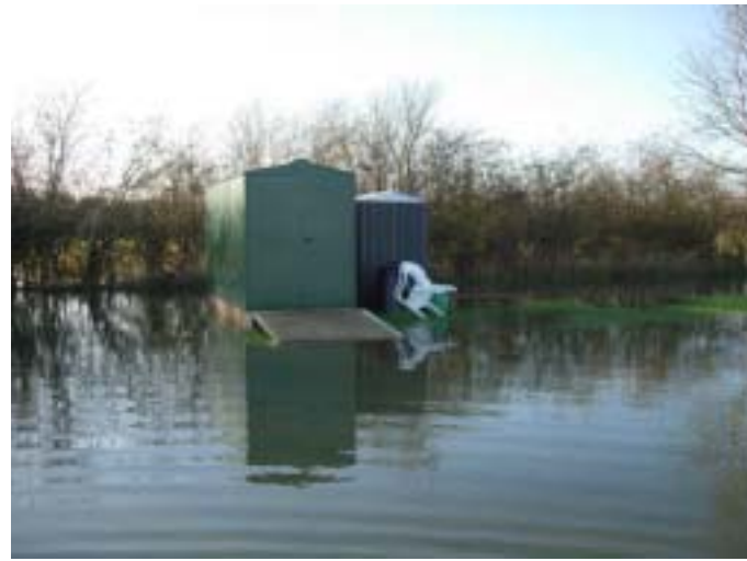
The equipment hut with adjacent toilet facilities in the floods.

May. Everything was so protracted that we nearly lost our Lottery grant. The time was extended twice and the courts were eventually finished two days before the final deadline which was the end of May. We were fortunate that our terrain meant that we did not need to put in a drainage system so that the Lottery grant was