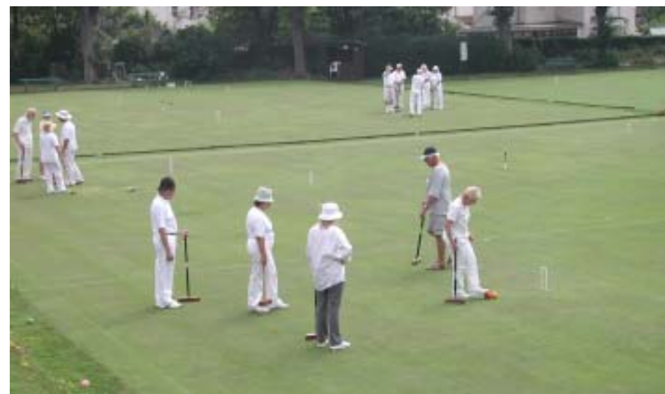
SECF summer school in session last season