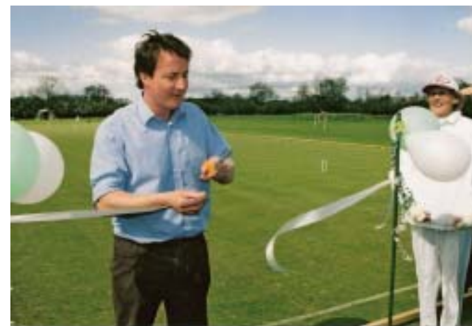
David Cameron cutting the tape to open the courts, which are behind him.

The grass grew and so did the weeds. We started to mow and a mole tunnelled over 30 yards in 24 hours but Yellow Pages produced an efficient mole-catcher. Despite our optimism, we were not going to be able to play on the new courts that year, but the odd ball hit across the dew in September showed that they were remarkably level and the rabbit fence was removed.