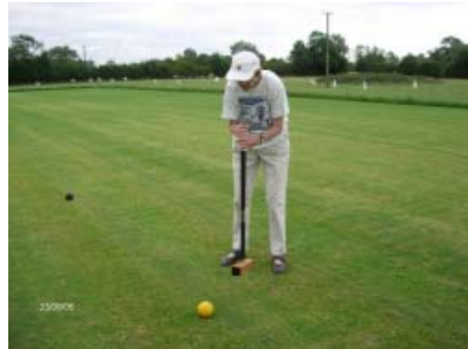
The Chairman plays the first ball on the new courts. anti-rabbit fence shown with plastic bags to deter deer.

Our field is in the valley of the Evenlode where it meets the Thames and is liable to flooding so our hut had to be raised above ground level. We were indebted to much local help in laying the base and to the Croquet Association who gave us the cost of an expensive hut. This had to be especially secure as it would hold the mower and we could not afford any vandalism. Later, with the Cricket Club, we purchased a half-share of a large container to store a second-hand ride-on mower and other items of equipment.