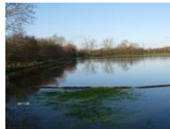
The courts flooded, end of November 2006