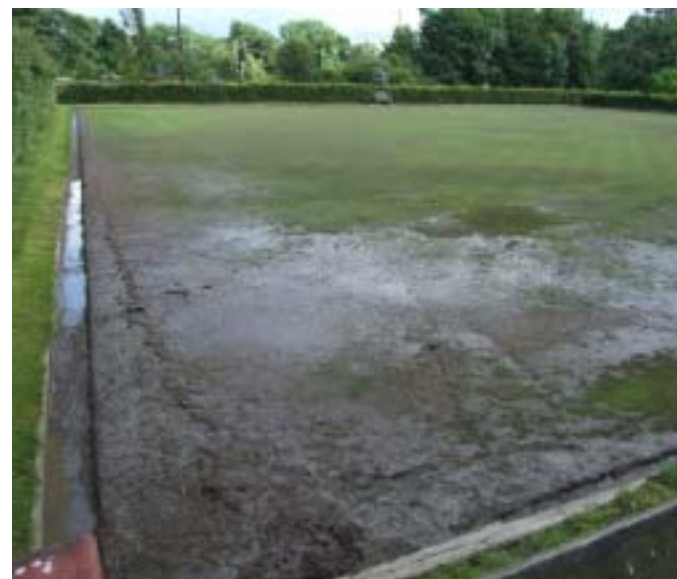
Corner two at Tyneside, looking rather bedraggled

After a night of torrential rain, Sunday morning 1 st July appeared bright and sunny. The Tyneside team arriving at Exhibition Park to prepare their lawns for a Secretary's Shield match were greatly surprised to find they had to negotiate over two feet of water in the underpass at the entrance before they could reach the Club House. Surprise turned to horror as they approached the Pavilion lawn and found it several inches deep in a muddy sludge that had flooded down from the Town Moor. Their opponents, Huddersfield, arrived shortly after and were even less impressed as their round trip of over 250 miles plus the overnight stay in a local hotel appeared to have been in vain. The CA guidance notes on how to resolve the tie in inclement weather did not seem to apply to a flooded lawn leaving only one lawn fit to play the match. As both teams wanted to play croquet, common sense prevailed and it was decided to play two rounds of two doubles, double banked. If the match could not be resolved by games won, a result would be based on the net points scored over the four games. In the event the latter situation applied and Tyneside won plus 8.