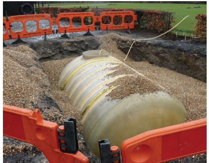
The underground tank, a substantial beast

So work began under the most appalling conditions imaginable. A cold, wet, dank February, lightened only by the perpetual smiles of the Rainmakers as they installed the pipework, up to their navels in freezing water.