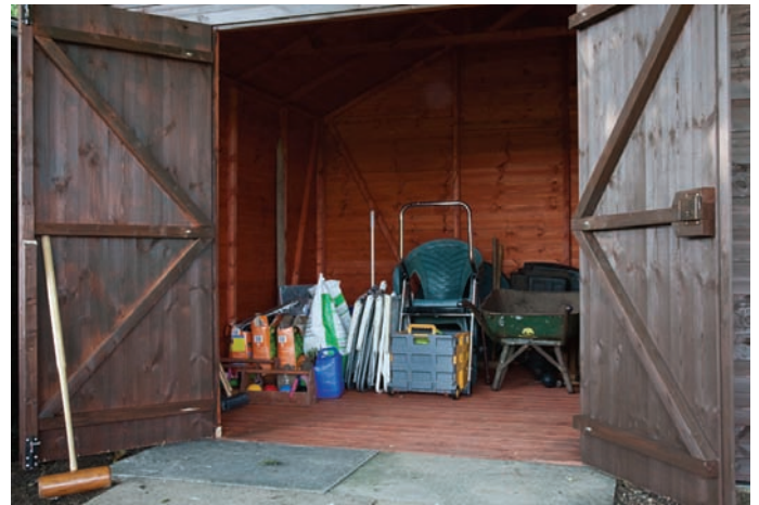
The new shed at Beverley installed and working to purpose.