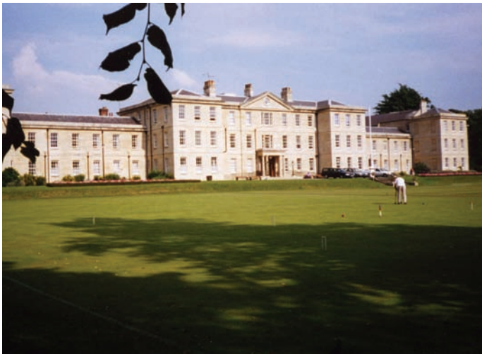
St Andrews Hospital home of Northampton CC

couple of years back when age, illness, moving away or abroad took its toll, though newer members came in, helped, one tends to think, by our own more recent interest in golf croquet. For the first twenty years we only played Association or, for less adept members, what used to be called 'Short Croquet'.