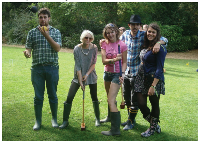
Ready to take on croquet

Croquet East, London's most stylish croquet club, was officially formed. A splendid result!