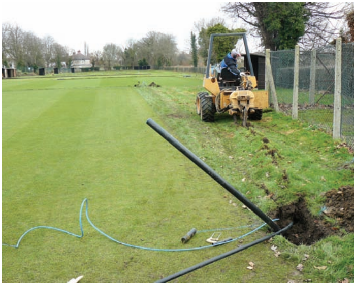
Insetting the channels of the pipework around the lawns

Fortunately, our own CA Development Committee was more sympathetic and quickly awarded us a major development grant of £5 000 topped up with a helpful £500 from the South East Federation. We could now afford to go ahead but with no contingency and the knowledge that we would end up with, at best, zero cash in the bank. We could have waited until our cash reserves built up further but we had, by now, been awarded the final round of MacRobertson Shield Test Matches and we were fretful about lawn quality. Now the club members came up trumps and one in particular made the difference which enabled us to decide at the end of 2009 to proceed.