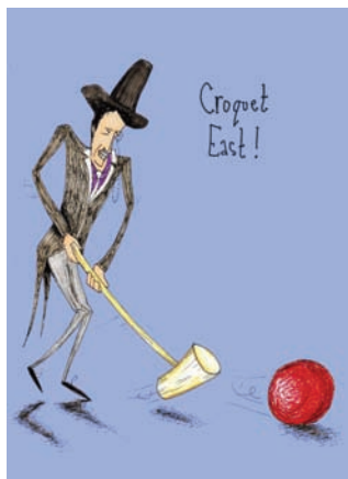
Croquet East Logo

This sounded right up my street...for too long had croquet been the reserve of the old and dowdy. It was time to bring back the fashion, the finery and the titillation and to reclaim the 'exquisite game' for the younger generation! I was to be a pioneer, pushing