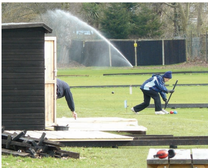
Job done and the system in action

is likely to be in short supply in the future. Water flows in a tributary of the Thames past our lawns, on its way to Hurlingham, and we discovered from the Environment Agency that we could extract 20 cubic metres a day without the need of a licence. Our Contractor installed the necessary additional pipework and pump which unfortunately then didn't work. But after several months of thought and trial, amid much denial by the pump supplier, the pump was replaced and all is now well. We pumped 767 cu metres this summer, even with the problems.