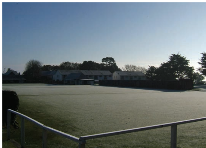
The lawns at Budleigh resting under December frost

At the end of 2009 we consulted the Sports Turf Research Institute (STRI) over problems we had encountered with the dollar spot fungus. They advised us to obtain equipment for regular aeration of the lawns throughout the season and suggested some