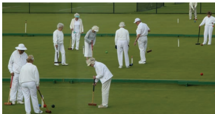
Play in progress on a club day