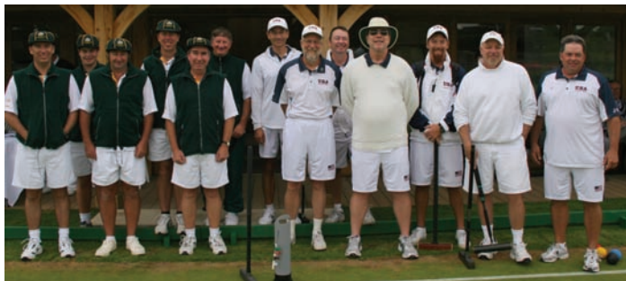
Australia and USA line up at Roehampton before doing battle in the MacRobertson Shield

The construction programme over-ran and the finishing touches were still being applied as the MacRobertson teams arrived for their first practice session. But it was the perfect occasion for such an inauguration! The new pavilion has been much admired and the additional facilities have been greatly appreciated by both croquet members and visitors.