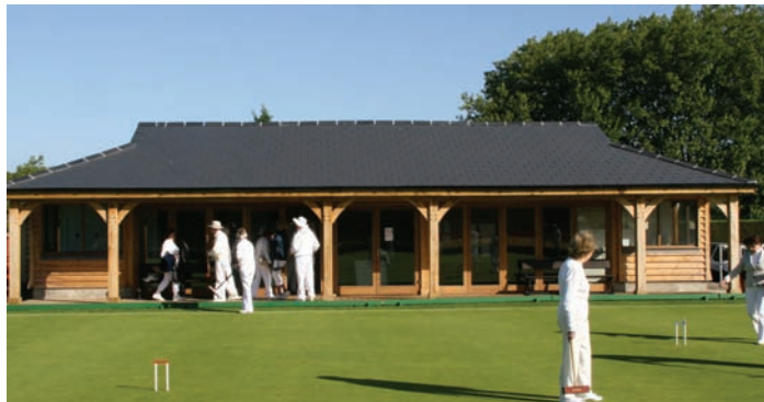
The splendid new pavilion at Roehampton

The 2010 season marked a memorable year for croquet at Roehampton Club which included: increasing membership, record levels of activity on its four lawns, new coaching and development programmes, the opening of its new pavilion, hosting the MacRobertson Shield as well as six CA open tournaments. This article is a celebration of these achievements, which we hope will interest and encourage others.