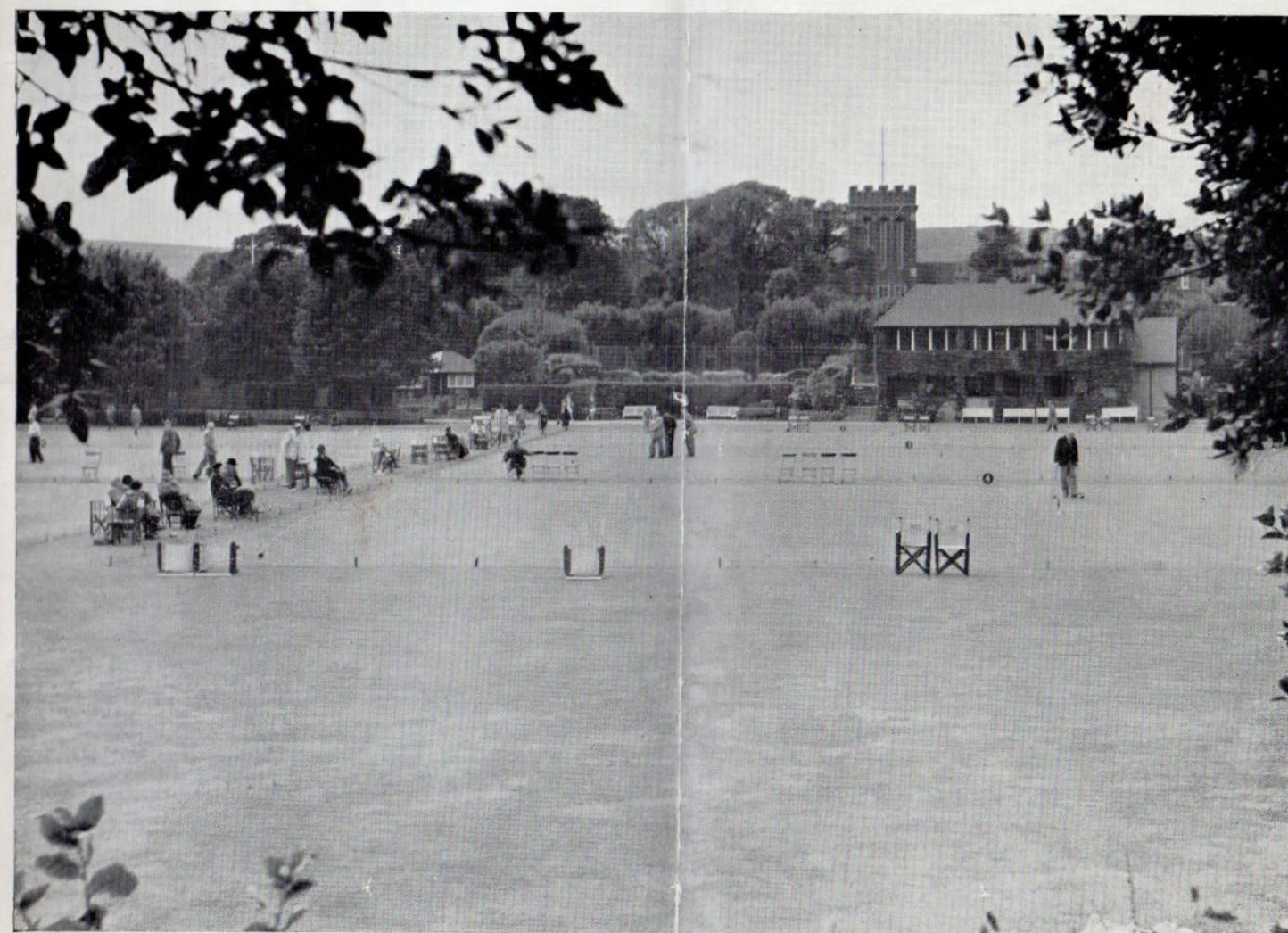
Devonshire Park, Eastbourne

The Official Organ of The Croquet Association