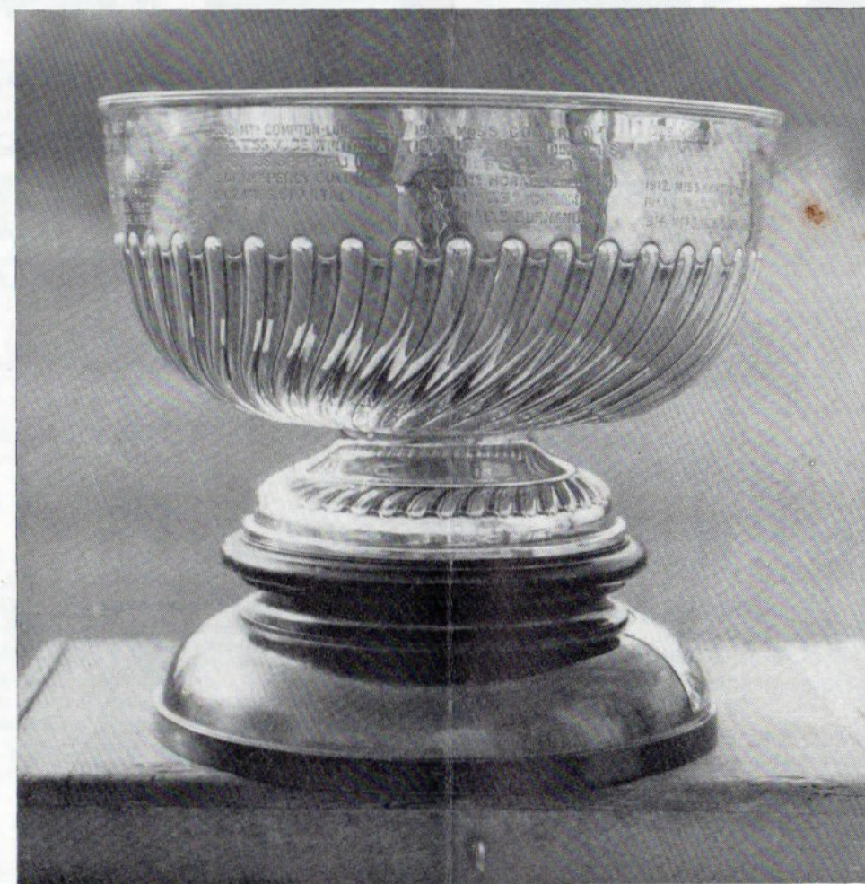
PEEL MEMORIAL BOWL

The Official Organ of The Croquet Association