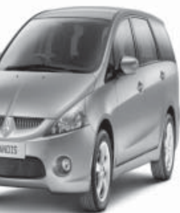
The Mitsubishi Grandis range from £18,499 OTR

The new Mitsubishi Outlander combines safety, visibility and 4-wheel drive power, with the practicality of an estate and the drive of a saloon. You can now also experience the Outlander Diesel.