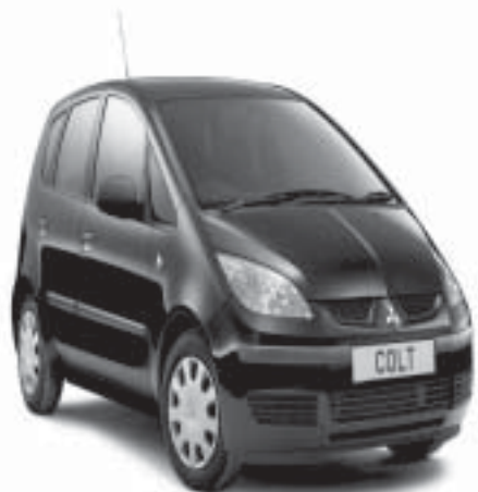
The Mitsubishi Colt range from £7,999 OTR

Sleek design and modern attitude. Underneath the clean-cut, contemporary exterior the stylish driving environment in which to enjoy the most spacious cabin in its class.