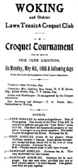
Gazette advertisement for the first Woking open tournament in 1908

The Club started its first annual open week long croquet tournament on Monday the 4 th of May 1908, there being no matches played in those days over the weekends and indeed no play of any description permitted on Sunday mornings. Woking is one of only four clubs in the country that has a virtually unbroken record apart from the periods of the two world wars, of holding annual weeklong open tournaments.