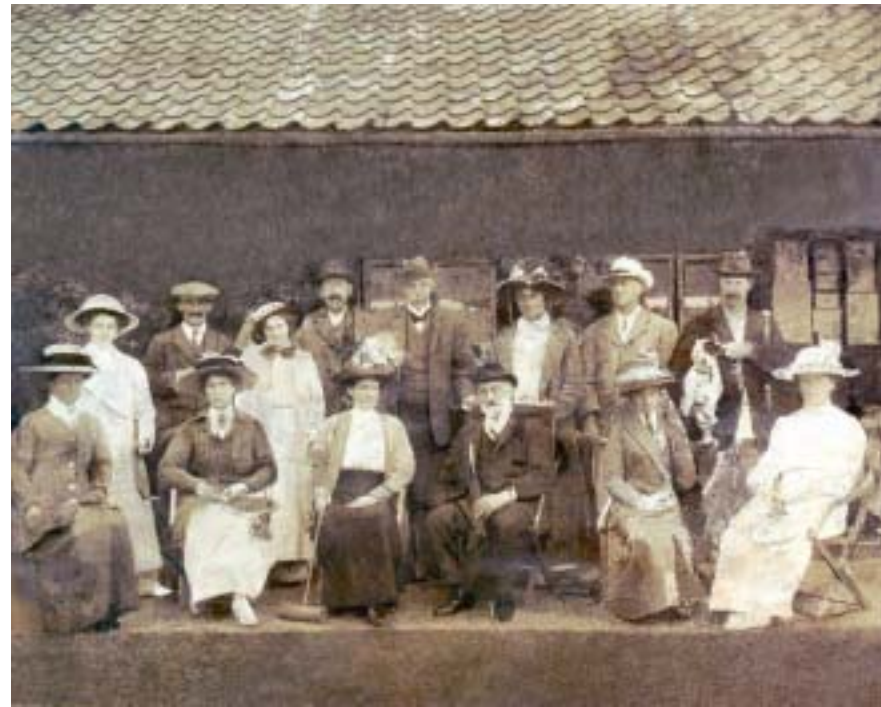
Pre World War I Members at Woking

Players who were fostered out to play at nearby residences were very well looked after and "several well-known hostesses in the locality entertained large house parties and were present in force at the tournaments, much to the delight of the representative