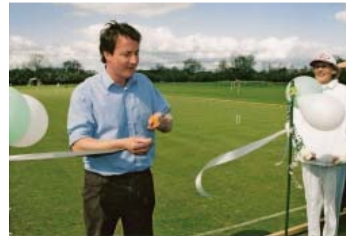
David Cameron cutting the tape to open the courts, which are behind him.

The grass grew and so did the weeds. We started to mow and a mole tunnelled over 30 yards in 24 hours but Yellow Pages produced an efficient mole-catcher. Despite our optimism, we were not going to be able to play on the new courts that year, but the odd ball hit across the dew in September showed that they were remarkably level and the rabbit fence was removed.