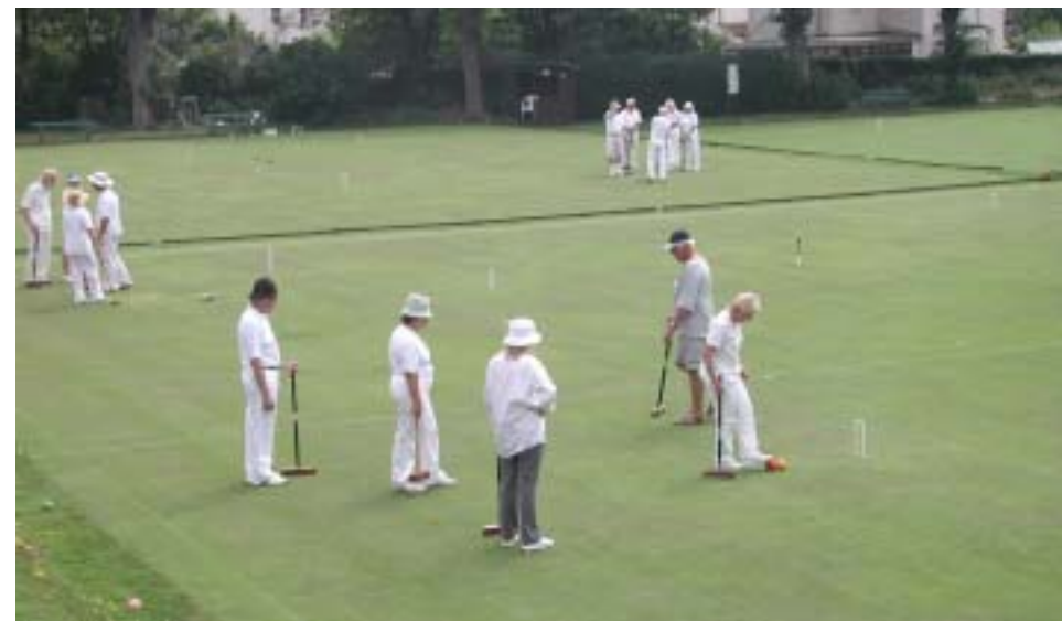
SECF summer school in session last season