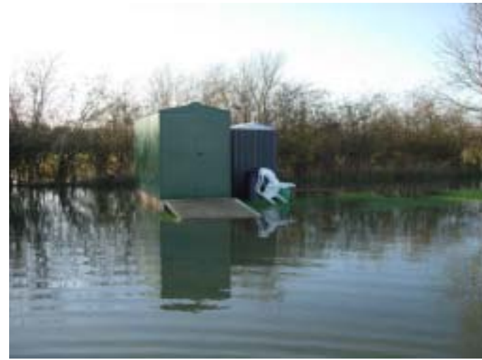
The equipment hut with adjacent toilet facilities in the floods.

May. Everything was so protracted that we nearly lost our Lottery grant. The time was extended twice and the courts were eventually finished two days before the final deadline which was the end of May. We were fortunate that our terrain meant that we did not need to put in a drainage system so that the Lottery grant was