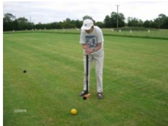
The Chairman plays the first ball on the new courts. anti-rabbit fence shown with plastic bags to deter deer.

Our field is in the valley of the Evenlode where it meets the Thames and is liable to flooding so our hut had to be raised above ground level. We were indebted to much local help in laying the base and to the Croquet Association who gave us the cost of an expensive hut. This had to be especially secure as it would hold the mower and we could not afford any vandalism. Later, with the Cricket Club, we purchased a half-share of a large container to store a second-hand ride-on mower and other items of equipment.