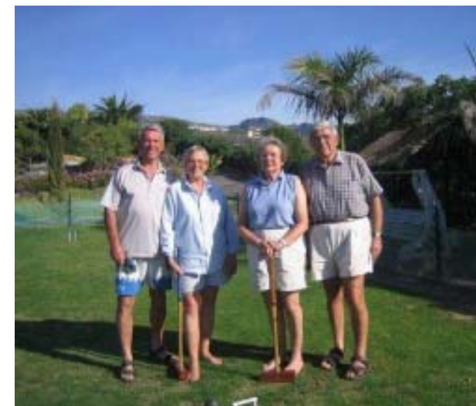
Visitors to La Gomera, enjoy a game of croquet earlier last month.

The first such, a new croquet set, was supplied for the bond site of La Gomera, Canary Islands..