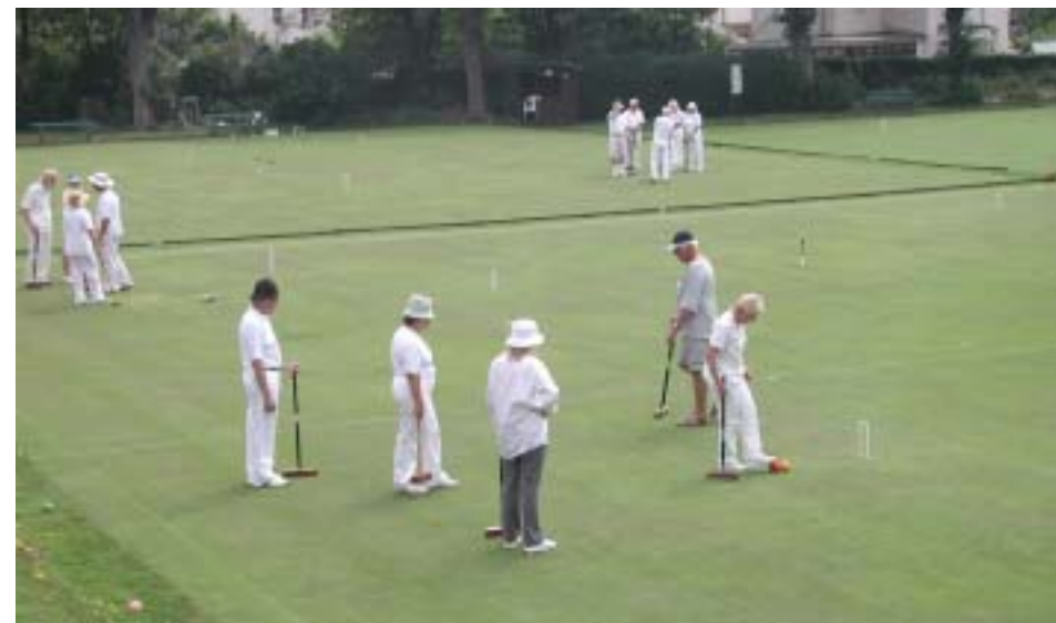
SECF summer school in session last season