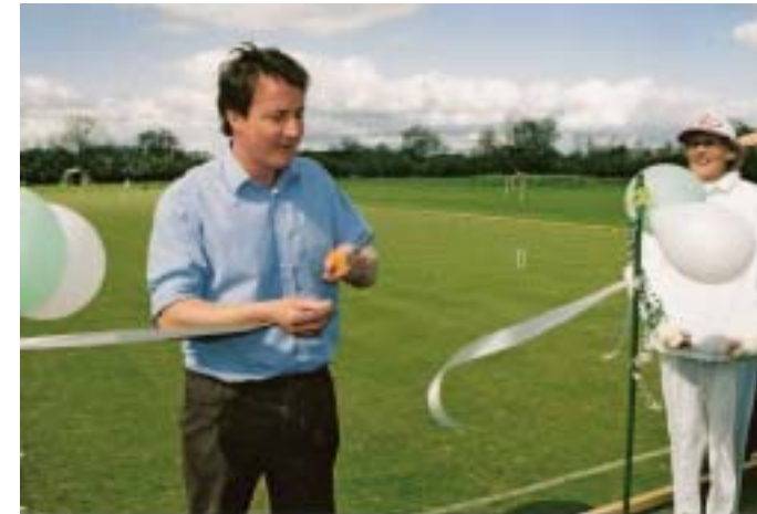
David Cameron cutting the tape to open the courts, which are behind him.

The grass grew and so did the weeds. We started to mow and a mole tunnelled over 30 yards in 24 hours but Yellow Pages produced an efficient mole-catcher. Despite our optimism, we were not going to be able to play on the new courts that year, but the odd ball hit across the dew in September showed that they were remarkably level and the rabbit fence was removed.