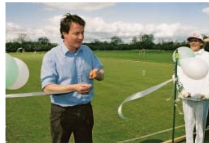
David Cameron cutting the tape to open the courts, which are behind him.

The grass grew and so did the weeds. We started to mow and a mole tunnelled over 30 yards in 24 hours but Yellow Pages produced an efficient mole-catcher. Despite our optimism, we were not going to be able to play on the new courts that year, but the odd ball hit across the dew in September showed that they were remarkably level and the rabbit fence was removed.