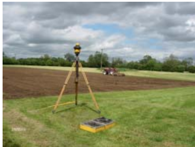
Preparation of the courts showing laser levelling equipment, with receptor above grader behind tractor which receives instructions.

The first stage was to get permission to use the local playing field and we paid rent for an open-access area which we used several times a week. The local Council mowed the grass erratically and we kept our equipment in a metal cupboard in a disabled toilet. We crept up from 20 to 40 members, but play was often interrupted by the arrival of louts with footballs so we were always looking for a better place to play. This came when the local Cricket Club offered us 2 acres of the field they were starting to rent from the trustees of a village charity. Members agreed that we should accept the offer, but it took over 6 months to sort out the lease and we had missed the autumn opportunity for laying the new courts. However, we mowed down part of the area to provide 4 half-size field courts, at least as good as those we had used on the playing field.