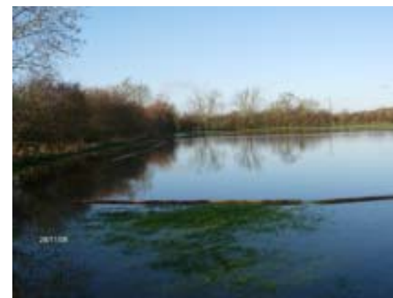
The courts flooded, end of November 2006