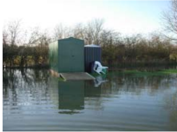
The equipment hut with adjacent toilet facilities in the floods.

May. Everything was so protracted that we nearly lost our Lottery grant. The time was extended twice and the courts were eventually finished two days before the final deadline which was the end of May. We were fortunate that our terrain meant that we did not need to put in a drainage system so that the Lottery grant was