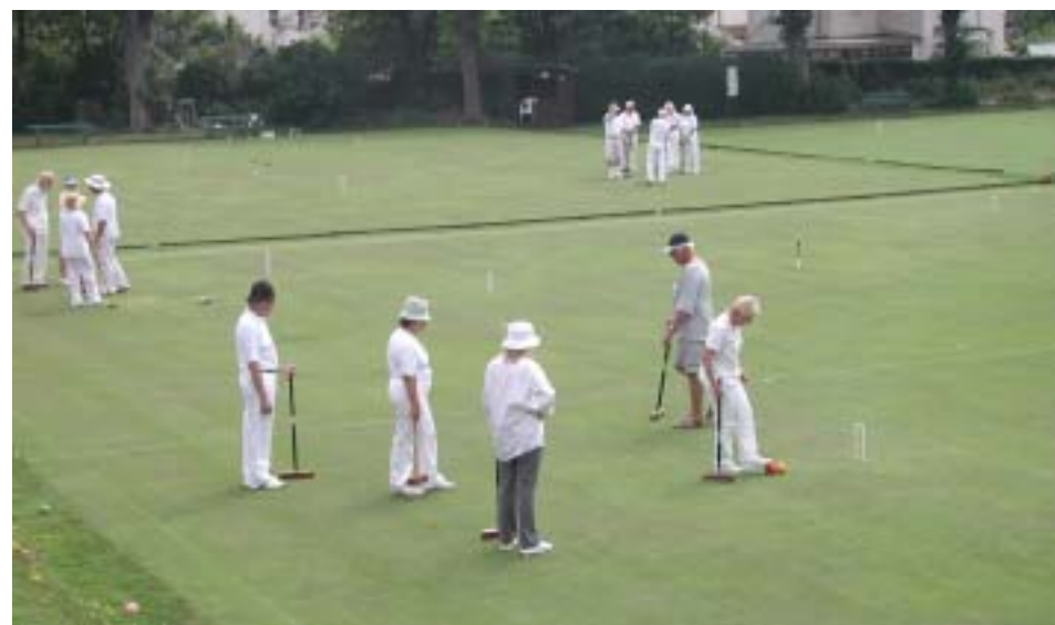
SECF summer school in session last season