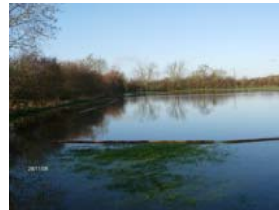
The courts flooded, end of November 2006