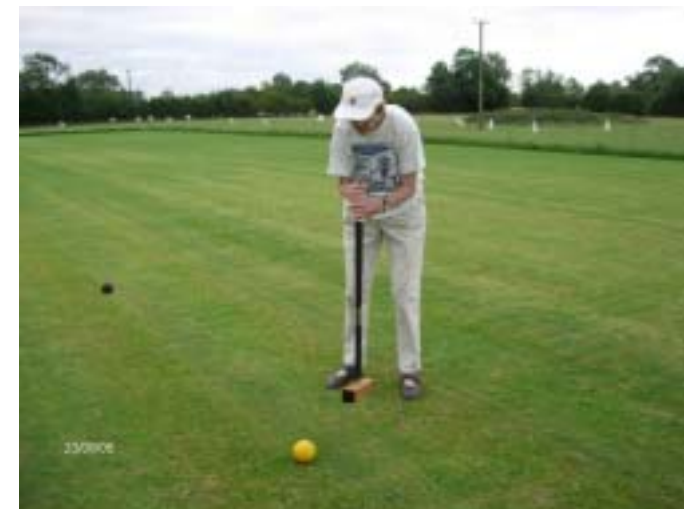
The Chairman plays the first ball on the new courts. anti-rabbit fence shown with plastic bags to deter deer.

Our field is in the valley of the Evenlode where it meets the Thames and is liable to flooding so our hut had to be raised above ground level. We were indebted to much local help in laying the base and to the Croquet Association who gave us the cost of an expensive hut. This had to be especially secure as it would hold the mower and we could not afford any vandalism. Later, with the Cricket Club, we purchased a half-share of a large container to store a second-hand ride-on mower and other items of equipment.